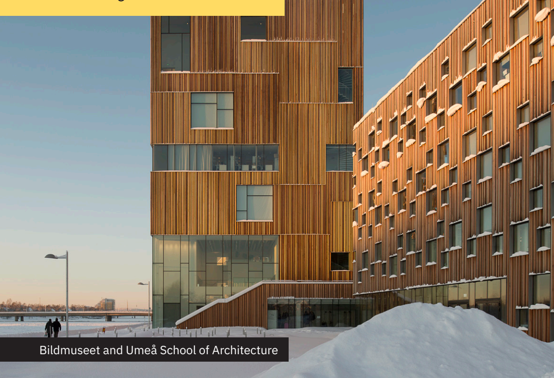
Bildmuseet and Umeå School of Architecture