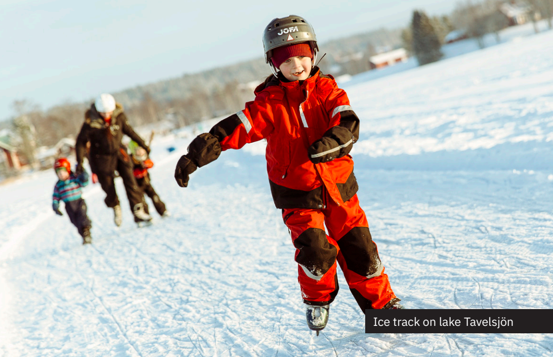
Ice track on lake Tavelsjön