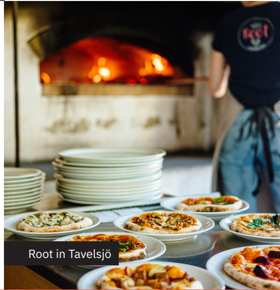
Root in Tavelsjö

For those who like to combine a meal with an activity, we can recommend O’Learys, which offers bowling and mini golf (indoors) or Orangeriet, with boules and shuffleboards. The app restaurant Pinchos has a circus theme and is usually a real children’s favourite. Take a trip to Tavelsjö and you will find Root, a restaurant that offers both pizza and activities.