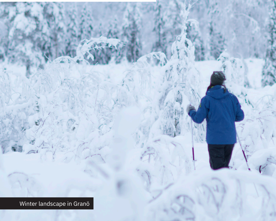
Winter landscape in Granö

There are several companies in the Umeå region that can help you with that. See visitumea.se for more info.